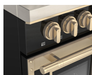
F4EIR365BR1-BK GLOSSY BLACK RAL 9004