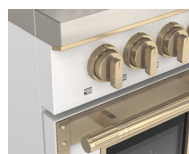
F4EIR365BR1-MW MATTE WHITE RAL 9016