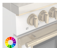
F4EIR365BR1-RAL RAL CODE