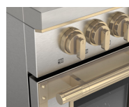
F4EIR365BR1-SS STAINLESS STEEL