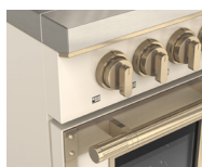
F4EIR365BR1-MI MATTE IVORY RAL 1015