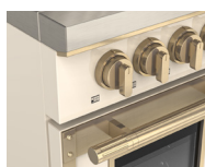
F4EIR365BR1-IV GLOSSY IVORY RAL 1015