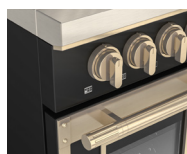
F4EIR365BR1-MB MATTE BLACK RAL 9004